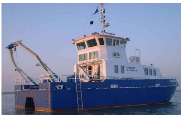
RV Three Counties

The primary compliance vessel is FPV John Allen , an 11 metre Redbay Stormforce cabin RIB which provides a high profile visible presence and has the capability for electronic observations/tracking and direct boarding of fishing vessels. A second Redbay Stormforce, FPV Sebastian Terelinck , is currently under construction and will provide the same capabilities as FPV John Allen with the additional benefits of greater manoeuvrability and shallower draught as a consequence of being fitted with waterjet propulsion.