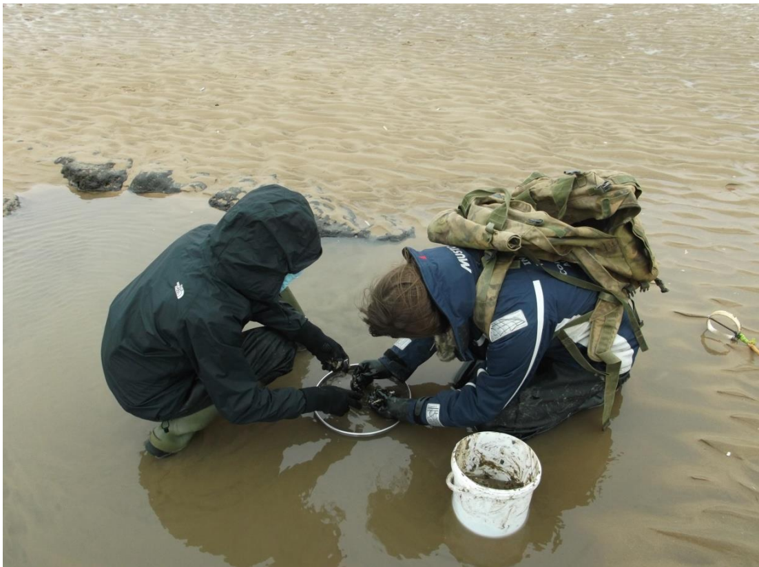
25. Collecting shellfish samples