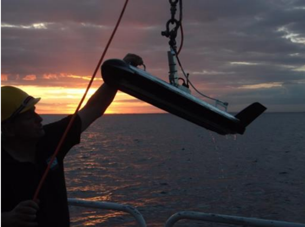
14. Deploying side scan sonar