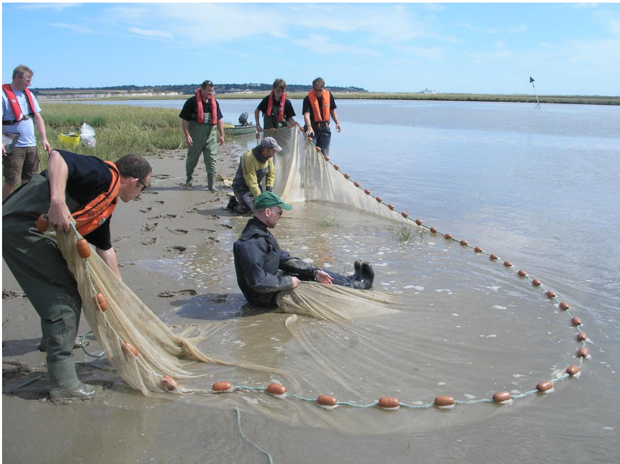
9. Beach seine netting in partnership with Environment Agency and K&E-IFCA

Partnership working will be particularly important during the coming years to ensure there is a consistent, joined-up approach for monitoring and protecting features and habitats within the developing network of Marine Protected Areas. Eastern IFCA is committed to regular review of its scientific and enforcement functions with partner agencies to ensure resources are optimised amongst the Defra family bodies and other organisations.