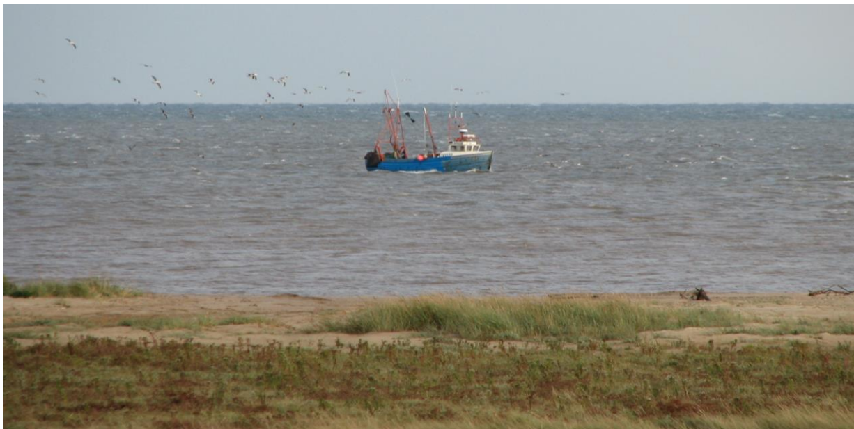
28. Fishing vessel off Gibraltar Point