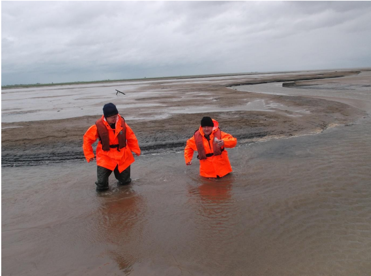
16. Conducting foot surveys in the Wash