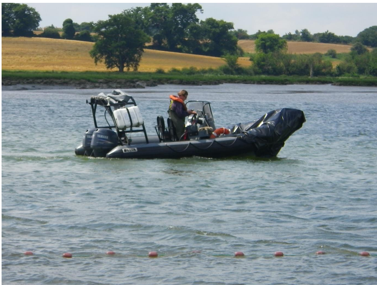
10. Pisces deploying beach seine net in River Deben

Informing the Authority's management of the Wash Fishery Order 1992 molluscan fisheries continues to be a core role for the team. In addition to this, it is a requirement for the Authority to manage the exploitation of all of its fisheries within maximum sustainable yields (MSY) by 2020 at the latest. In order to provide evidence to support this latter responsibility, the team must improve their understanding of both the relevant stocks and fisheries. The on-going crustacean project is being conducted for this purpose, as will a new project studying the District's whelk stocks and fishery. In order to fit this new project into the schedule, it has been necessary to exclude a number of lower priority projects that have been formally conducted. These will include the mussel surveys at Titchwell, the native oyster and cockle surveys in the Suffolk Rivers and the cockle surveys at Horseshoe Point. Table 2 shows the research work streams planned for 2015-2016.