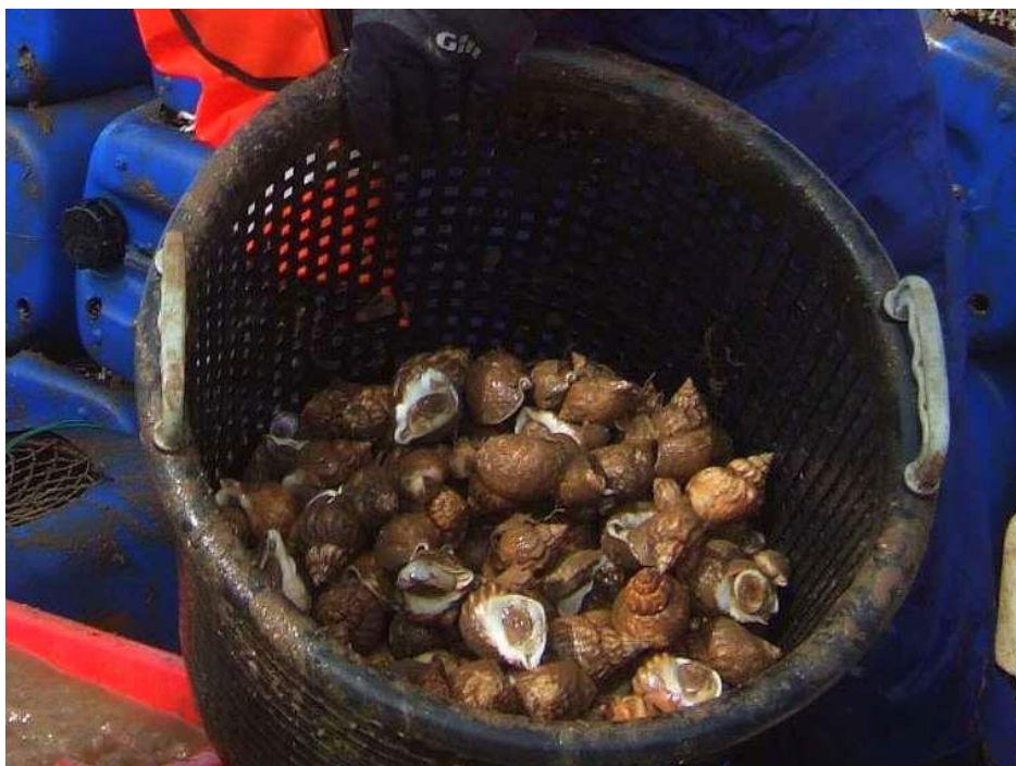
20. Common whelk, Buccinum undatum