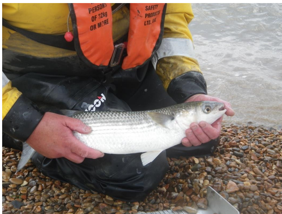
19. Grey mullet caught during River Deben survey