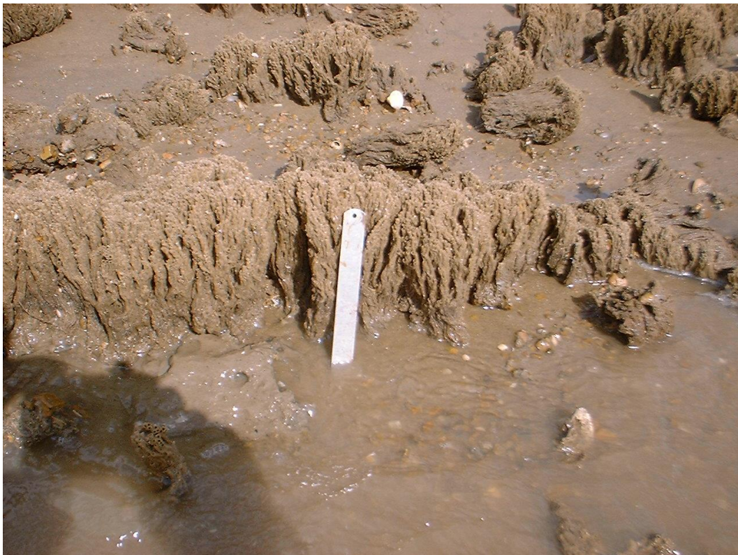
15. Inter-tidal Sabellaria spinulosa reef