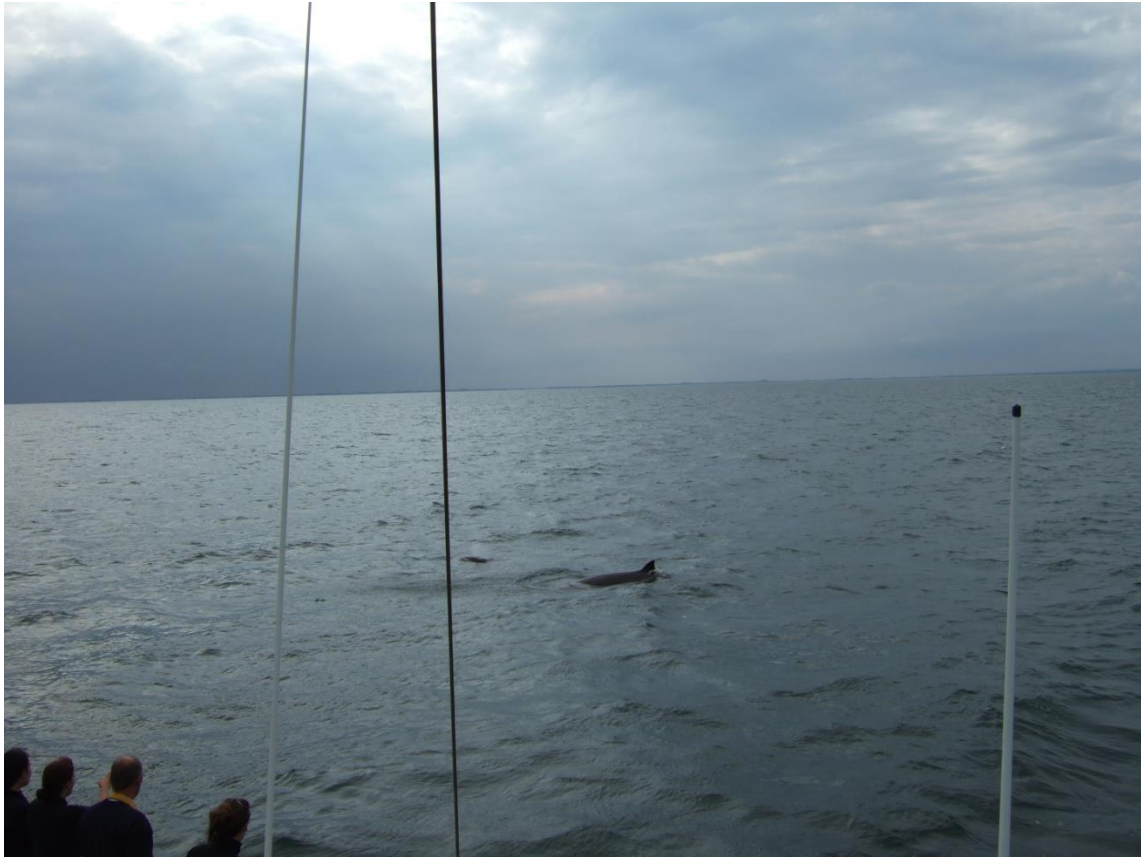
7. Northern bottlenose whale in the Wash

The Research and Environment teams provide a broad range of services to the Authority, including field work, data collection and analysis, partner engagement, impact assessment and provision of advice. The team works synergistically across the organisation, but its two branches have distinctive roles to play within the Authority, as set out in this Plan.