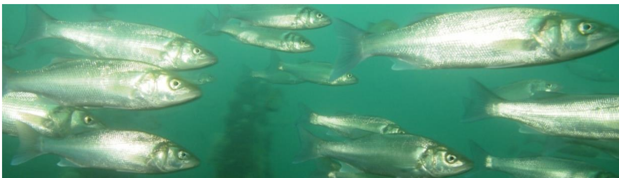
4. Bass shoal

This annual research and environment plan provides stakeholders with an overview of the key tasks that the Authority's staff will conduct during the 2015-2016 financial year. These work streams flow from the Eastern IFCA Annual Plan and the Research and Environment Strategy 2013-2018. Both of these documents result from instructions and guidance issued to IFCAs by Defra, the Marine Management Organisation and ultimately the Marine and Coastal Access Act 2009.