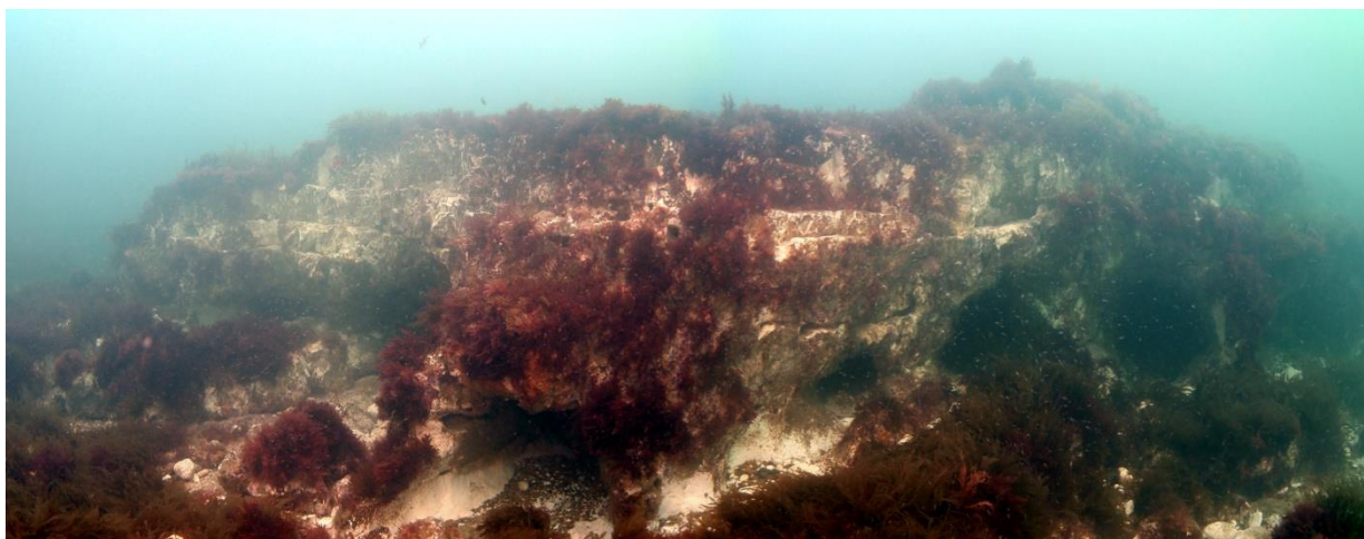
13. Chalk reef