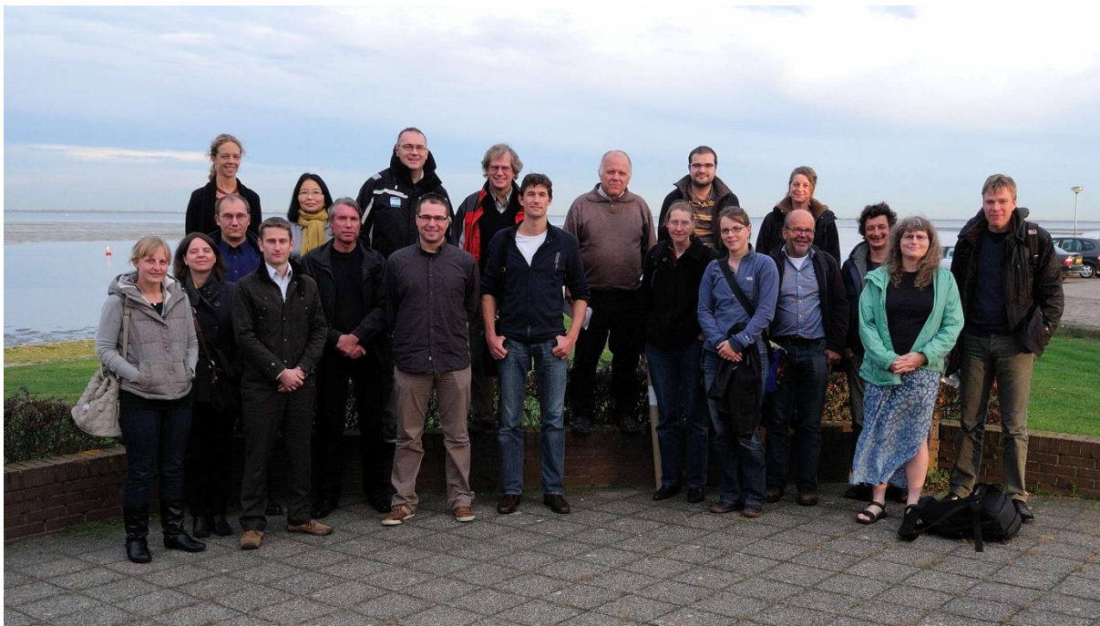
23. Participants of IMARES workshop in Netherlands