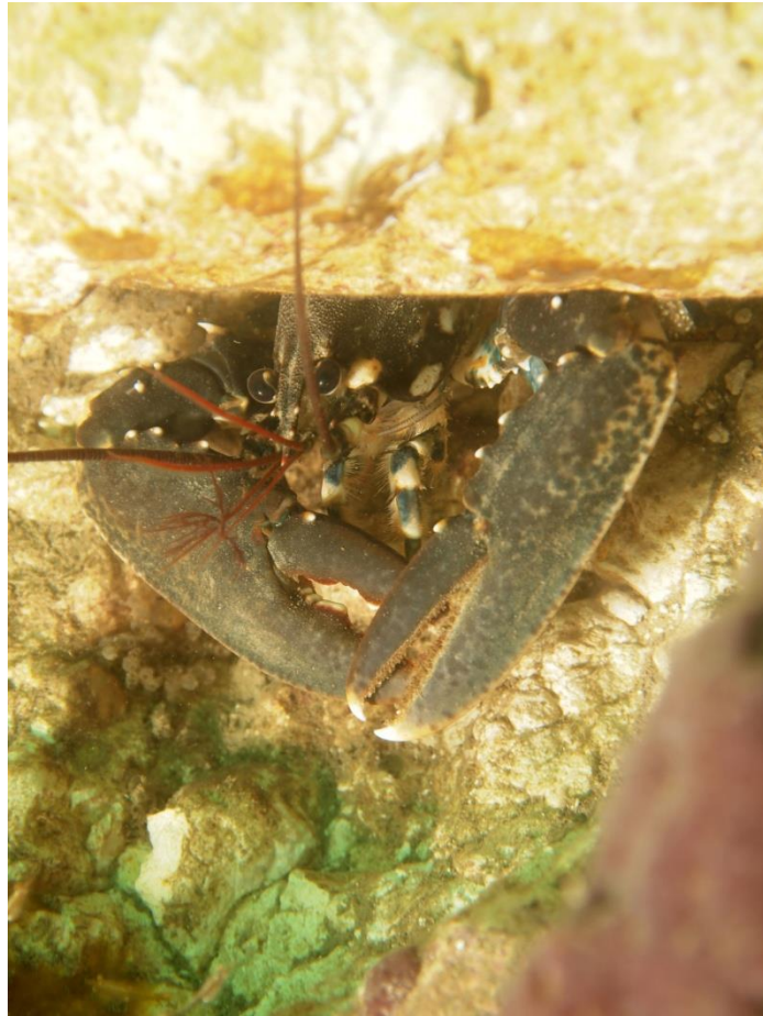
2. Lobster, Homarus gammarus