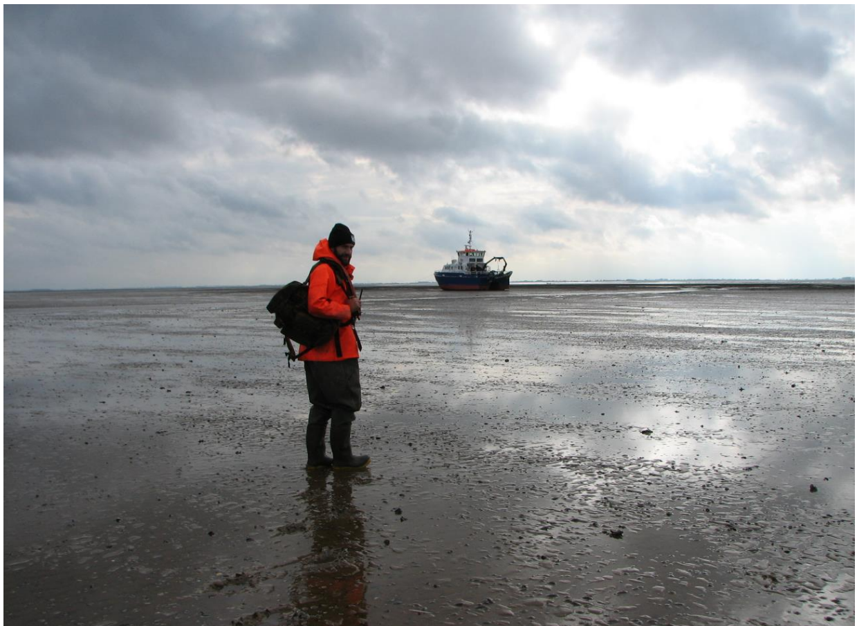
29. Surveying shellfish beds in The Wash