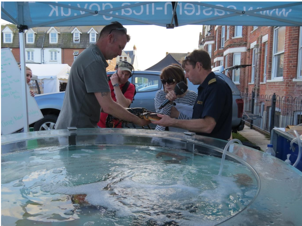
22. Display tank at community show