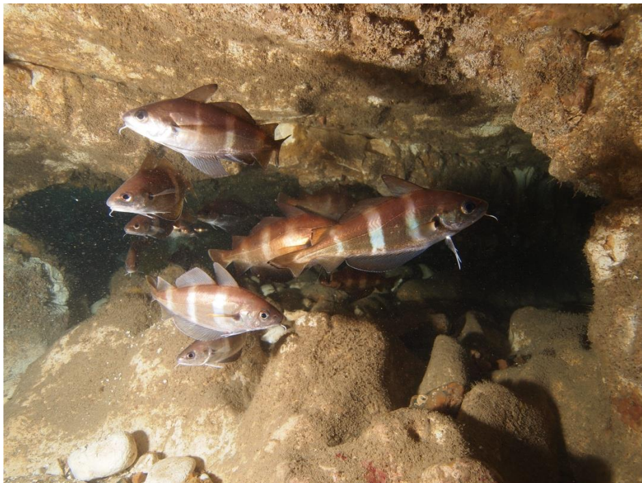
3. Pouting or bib, Trisopterus luscus