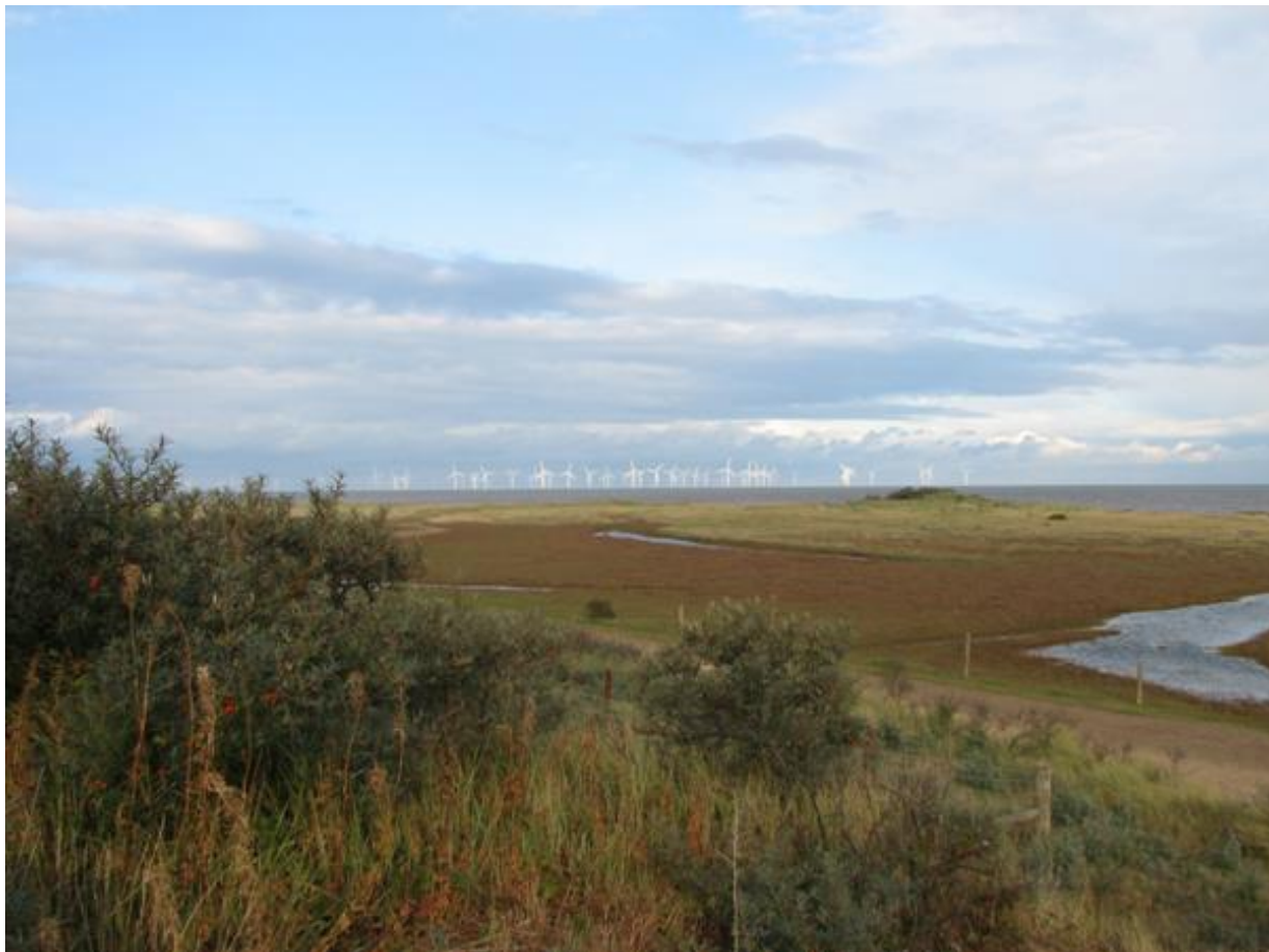
31. Lincolnshire coastline