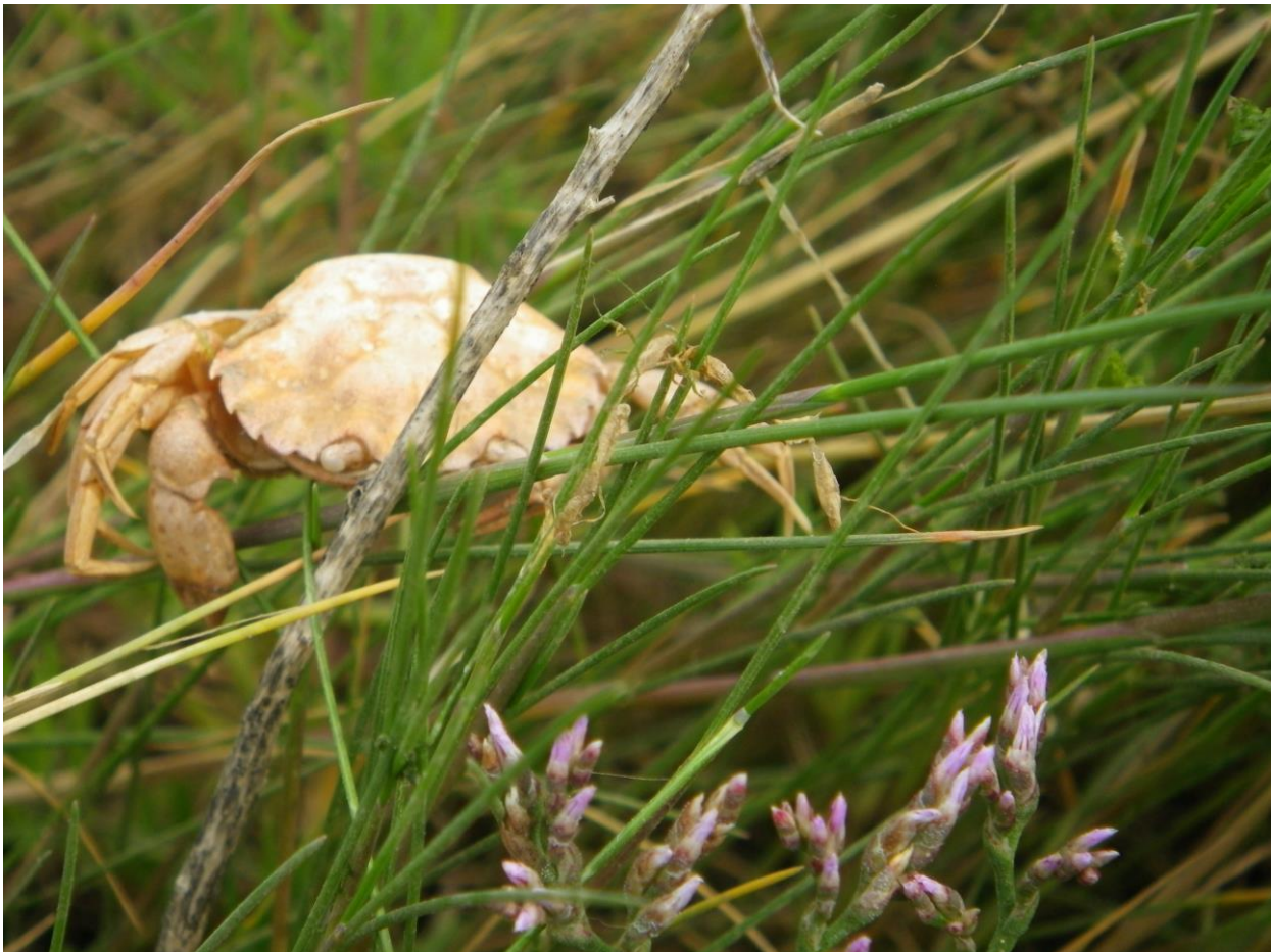
30. Moulded crab exoskeleton Horseshoe Point