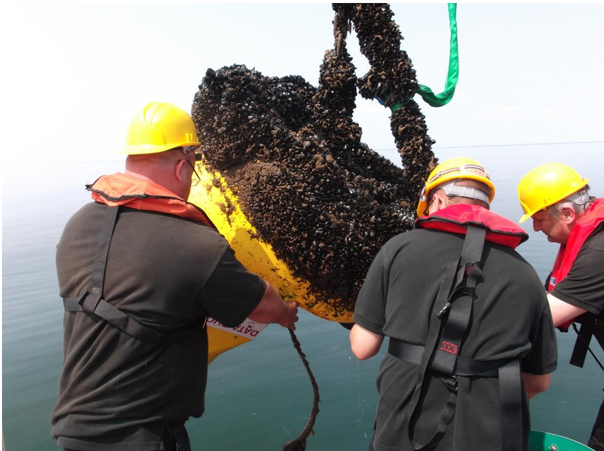
17. Servicing the Authority's data buoy