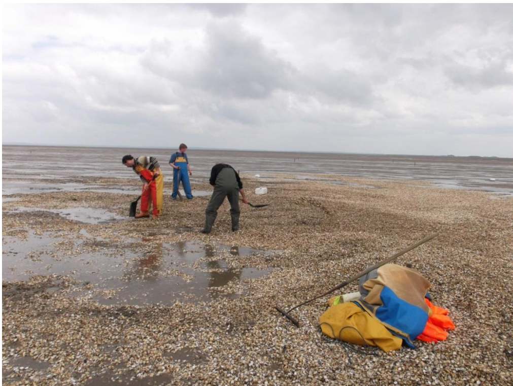
21. Laying shells for mussel regeneration project