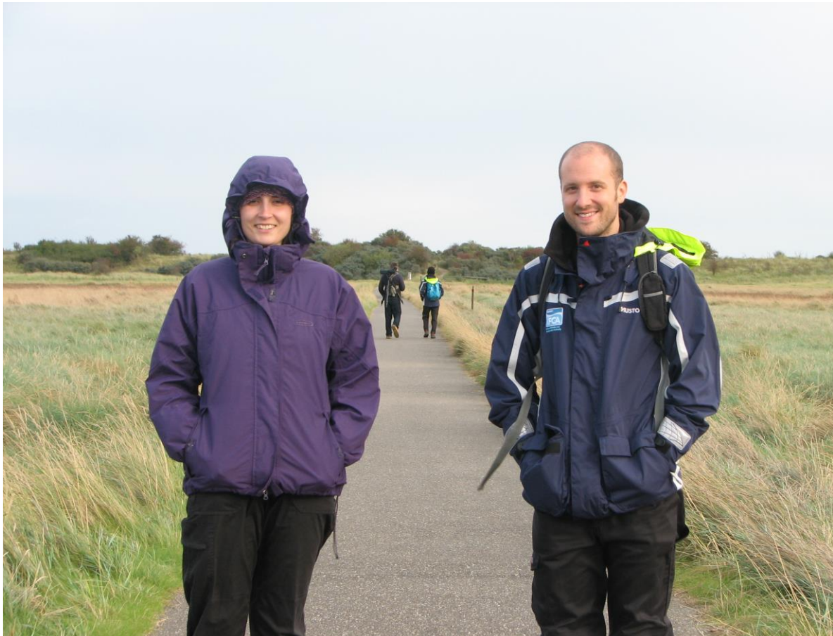
26. Gibraltar Point site visit

* The environment team has one Senior Marine Environment Officer and three Marine Environment Officers, filling a total of 3.7 Full Time Equivalent posts. Taking into account weekends, public and personal holidays, the team has a maximum total of 856 working days available during 2015/16. Of these days, it has been estimated that 20% will be required to fulfil staff development requirements (including training and appraisals) and necessary administration duties (planning, managing, liaison and reporting). This leaves a total of 749 days Environment officer time available during 2015/16, which, with the team now at full capacity, delivers an increase of 12.5% on 2014/15.