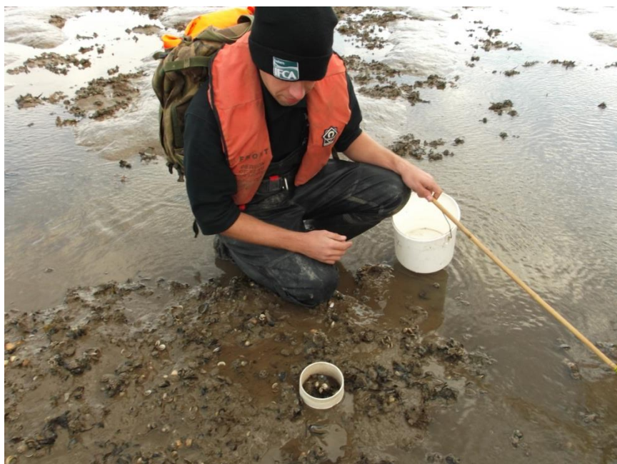
12. Conducting survey of inter-tidal mussel bed