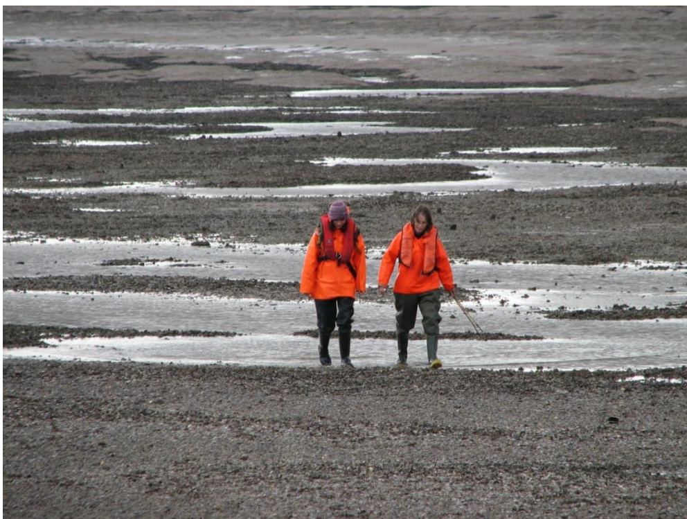
6. Surveying shellfish beds in The Wash

In order to support UK commitments to developing a well-managed, ecologically coherent network of marine protected areas, the Authority must have appropriate fisheries management measures for these conservation sites in place by December 2016. Providing the evidence required to support such management decisions has been a considerable challenge for the Research and Environment team during the past year and will continue to be so into the foreseeable future. In addition to this relatively new challenge, the team must also continue to support the Authority's management of the Wash Fishery Order 1992 which oversees the major molluscan fisheries in The Wash. Additional research and environmental input will also be required in order to support the Authority's new strategic approach to holistic management of the major fisheries within the district, through a prioritised, risk-based framework (the Eastern IFCA Strategic Assessment). To achieve these goals the Authority must maintain the outputs of its existing research and monitoring programme, whilst also developing new skills to deliver the range of projects that will satisfy its new conservation and management requirements.