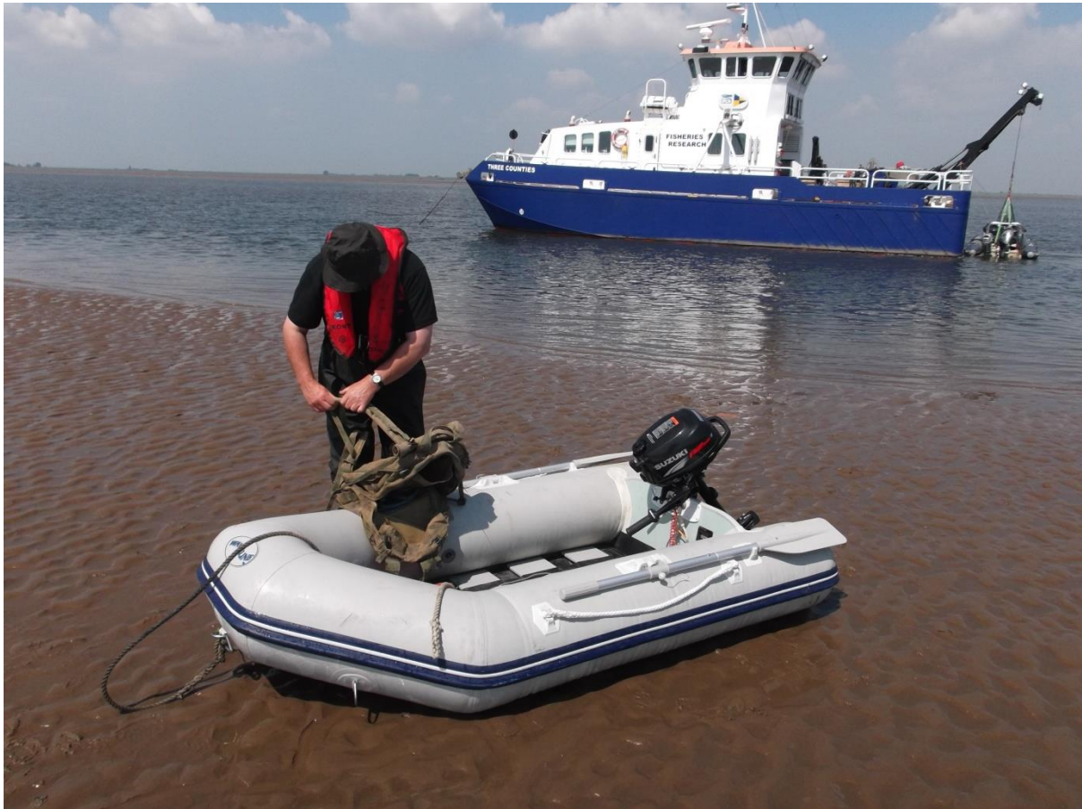
1. RV Three Counties and tender

This document is available in electronic form from the Eastern Inshore Fisheries and Conservation Authority website: