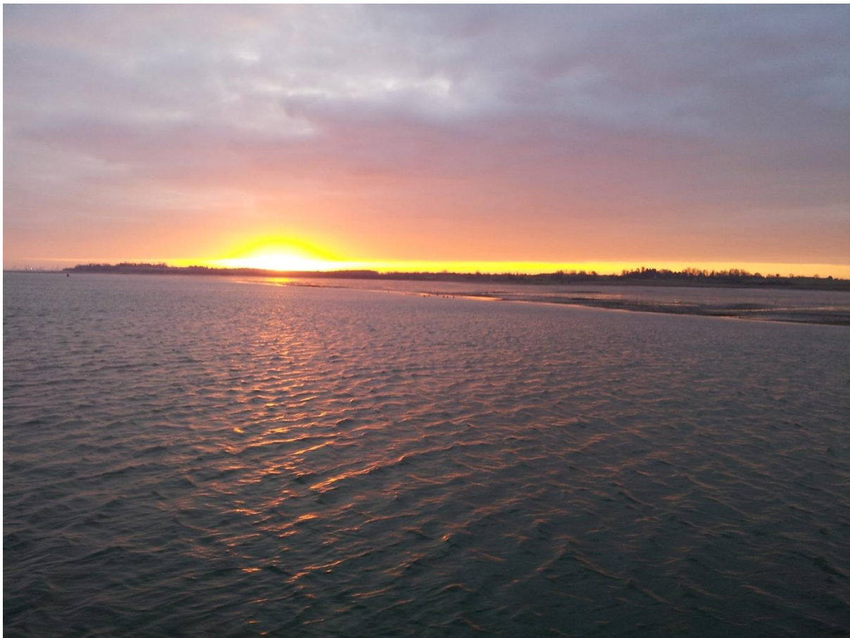
24. Sunrise at the River Stour