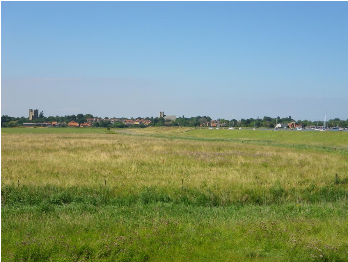
27. Suffolk site visit: Chantry marshes, Alde & Ore Estuary