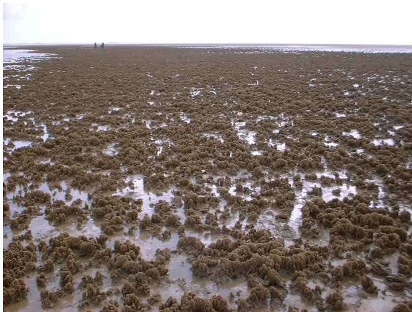
8. Intertidal Sabellaria spinulosa reef in the Wash