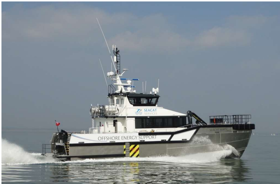
Seacat Magic – Crew Transfer Vessel Operating from Port of Grimsby Operating within the Triton Knoll Windfarm Array Call Sign "2JDI2" MMSI "235114973"

All Vessels Can be Contacted Via VHF 16 When Operational Infield