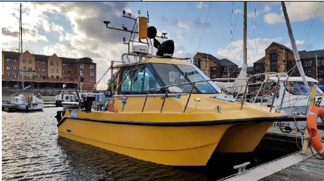
Fig 2 – MV Pulsar