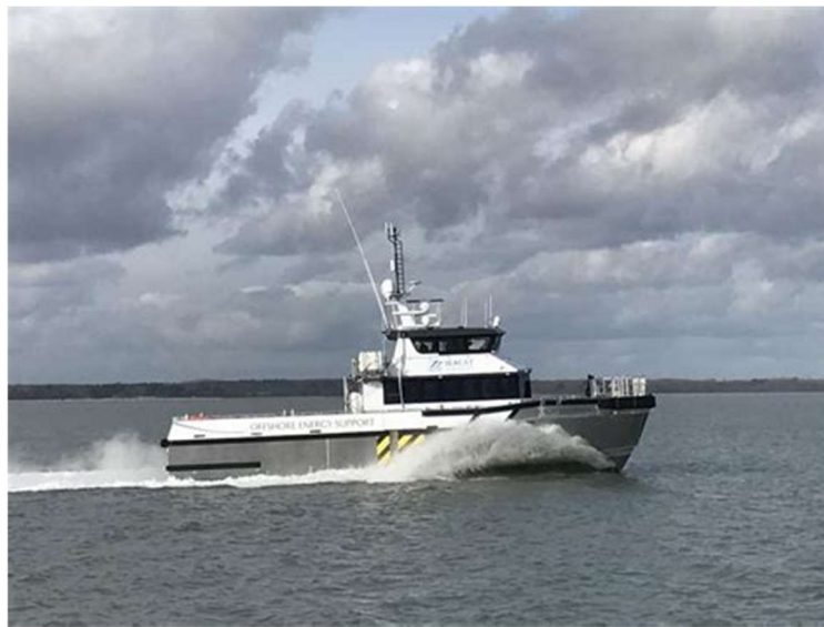
Seacat Enterprise – Crew Transfer Vessel Operating from Port of Grimsby Operating within the Triton Knoll Windfarm Array Call Sign “MAPS9” MMSI “232006483”

The following vessels continue to be active at Triton Knoll as outlined within previous issued NTMs