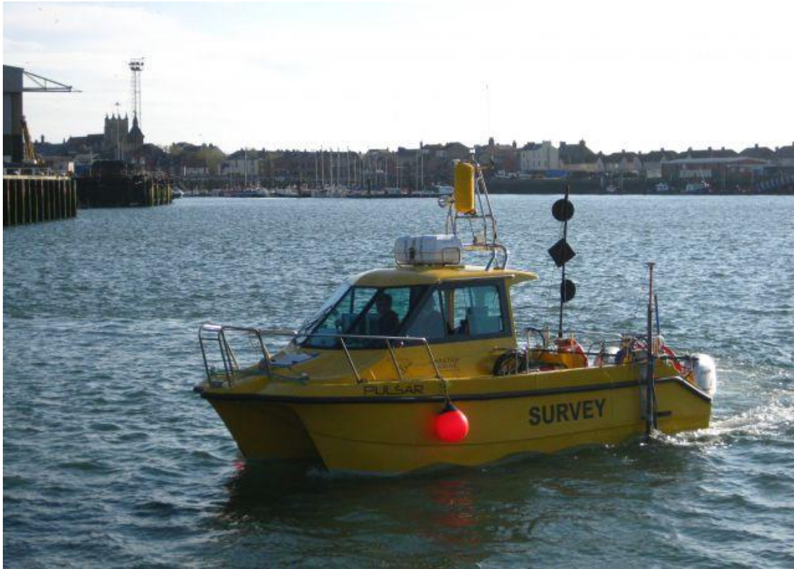
Fig 1 MV Pulsar