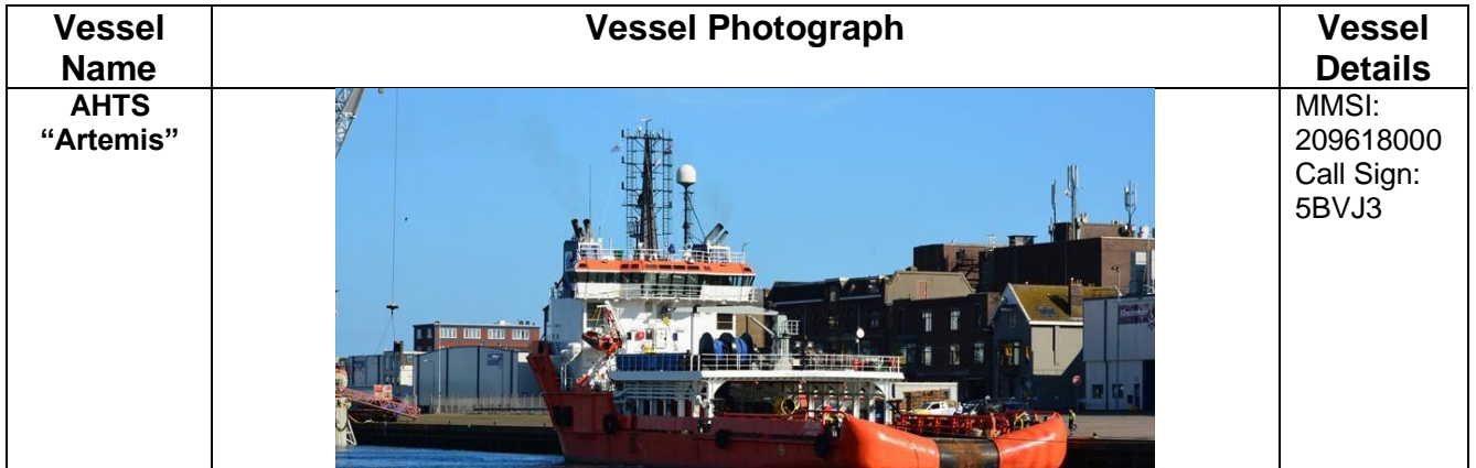
Table 1: Preparation Works vessel details