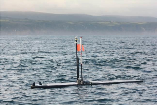
Figure. 1: Wave Glider

The instrument travels slowly on the surface under wave power. It is fitted with an orange flag, all-round white light and Radar Target Enhancer.