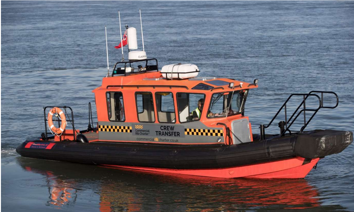
Figure 2: CRC Loadstar

The work will take place day time only however CPBS Gundog will remain onsite for 24hr a day until work is completed.