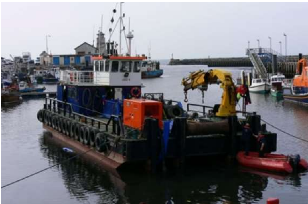
Figure 1: CPBS Gundog

CPBS Gundog is a 20m multicat workboat equipped with a 15t crane. It will act as the Dive Support Vessel and will be anchored using a 4-point anchoring system over the work location. Whilst on location, the vessel will support diving operations and lifting operations at the work site.