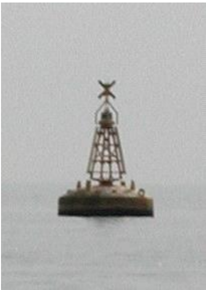
Figure 2: Class 2 Guard Buoy

Recording oceanographic equipment will be moored at :