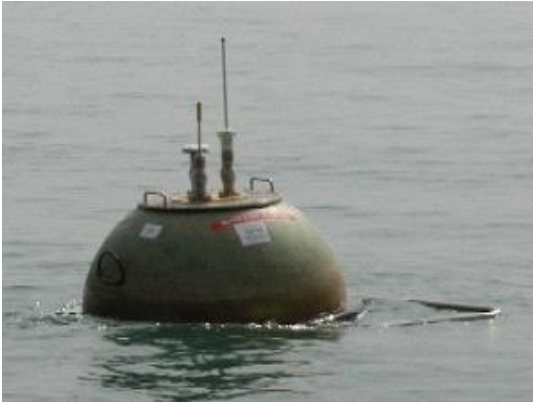
Figure 1: Waverider Buoy