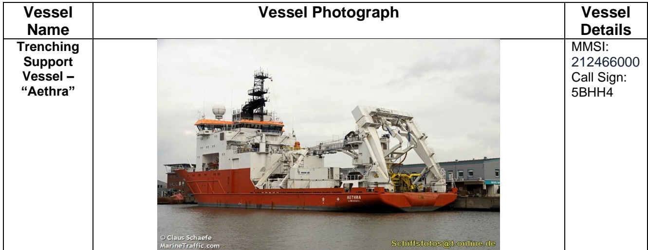
Table 1: Preparation Works vessel details