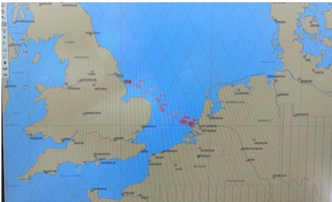
Figure 3: Vessel Transit Routes and Passage Plans

Passage Plans and Expected Vessels Routes are showed in Figure 3.