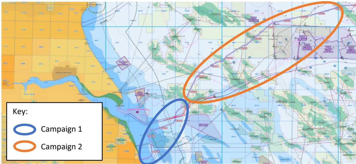
Figures 1: Overview of the Viking Link Interconnector Campaign 1 and Campaign 2