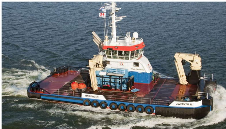
Zwerver III – Multicat / Tug Operating from Port of Hull Operating within the Triton Knoll Windfarm Array Call Sign “PCLQ” MMSI “246024000”