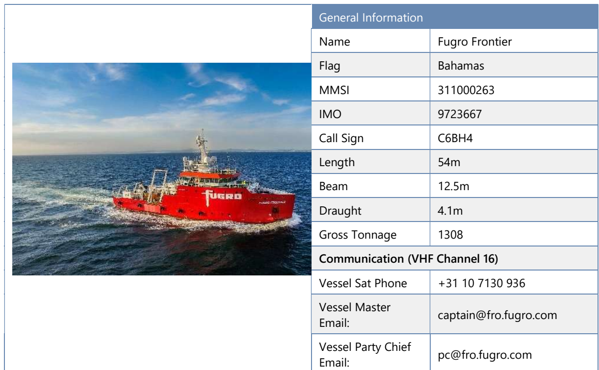
Table 2: Mainport Geo

Survey operations will be conducted on a 24-hour basis.