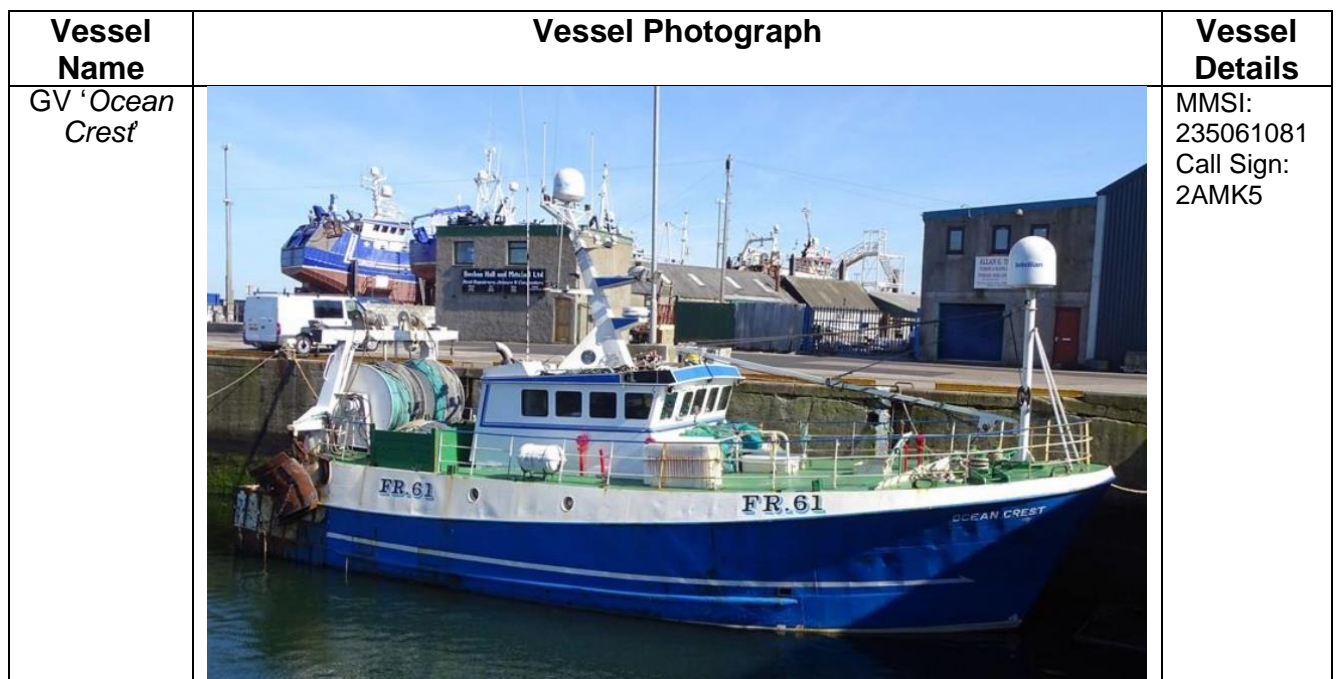
Table 2: Landfall Work vessel details

VHF CH 16 will be monitored at all times and will be used to contact the coastguard in the event of an emergency.