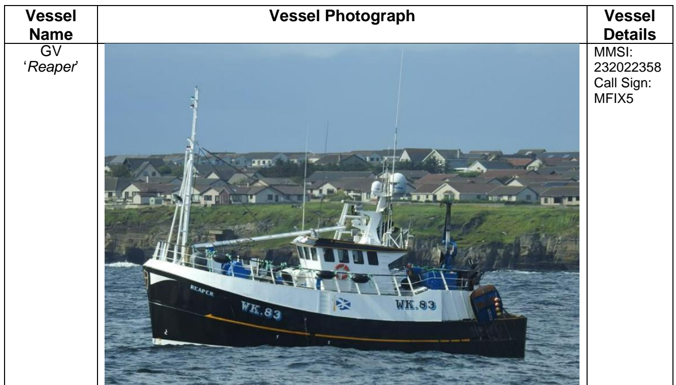
Table 2: Landfall Work vessel details

VHF CH 16 will be monitored at all times and will be used to contact the coastguard in the event of an emergency.