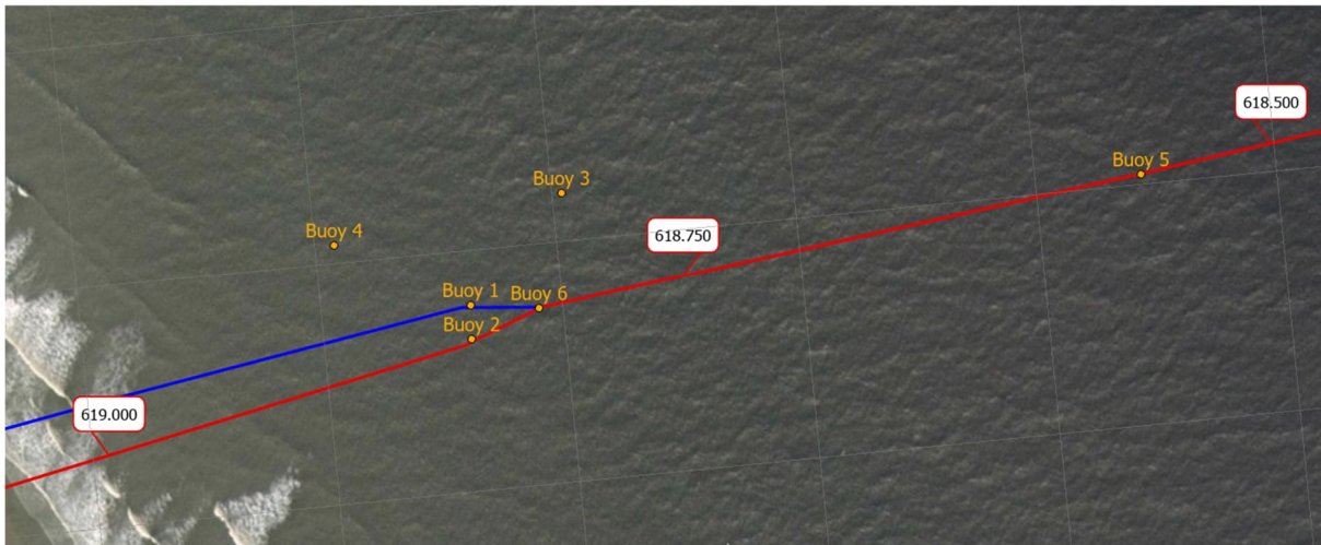
Figure 2 – Area of marker buoy locations (from M.B. #1 to #6)