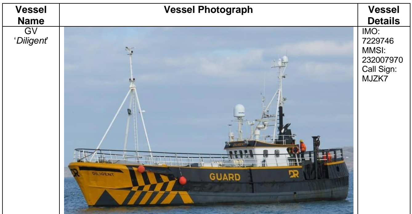
Table 2: Landfall Work vessel details

VHF CH 16 will be monitored at all times and will be used to contact the coastguard in the event of an emergency.