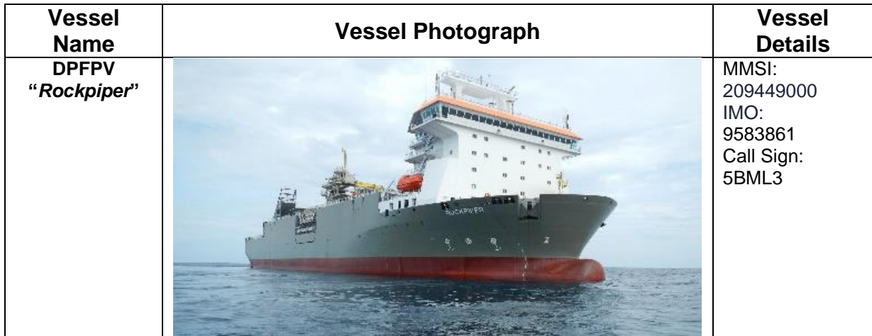
Table 2: Campaign 5 post-lay Rock Placement works vessel details