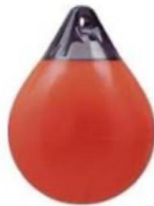
Figure 3 – Marker buoy