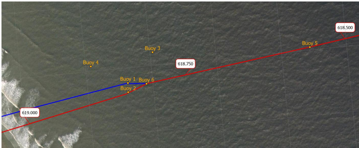
Figure 2 – Area of marker buoy locations (from M.B. #1 to #6)