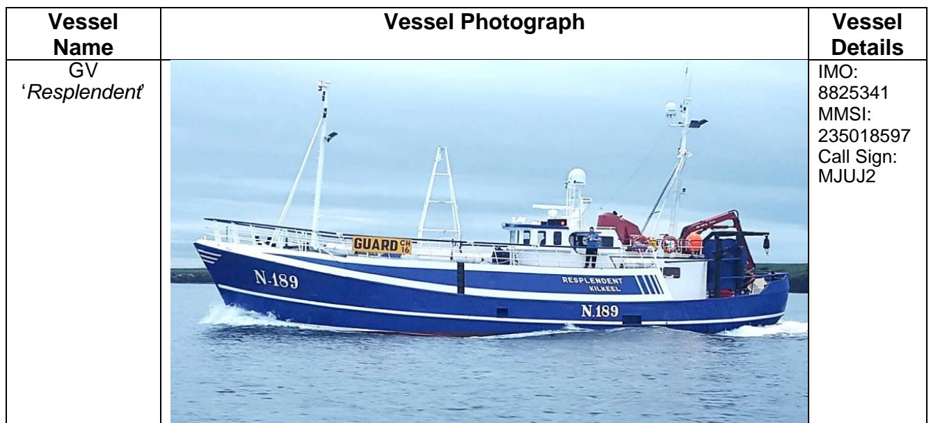
Table 2: Landfall Work vessel details

VHF CH 16 will be monitored at all times and will be used to contact the coastguard in the event of an emergency.