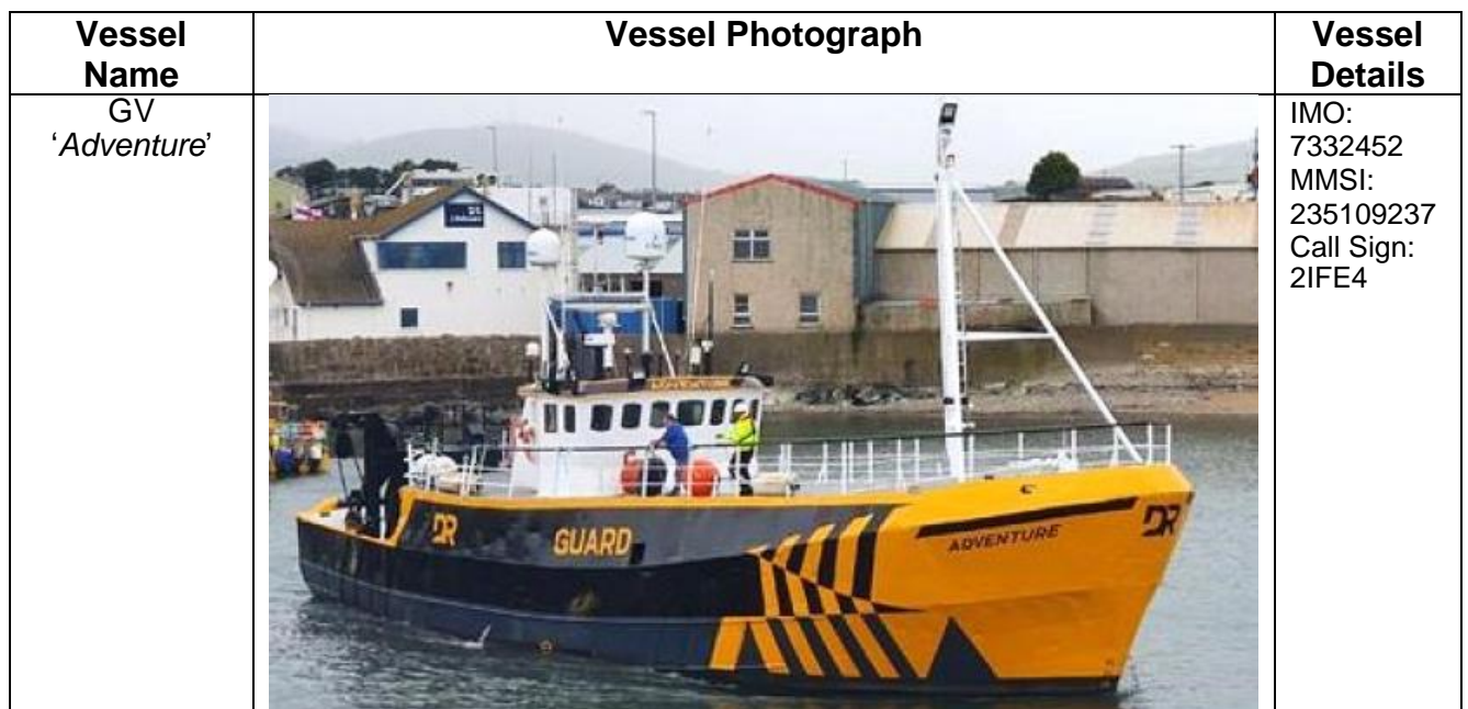
Table 2: Landfall Work vessel details

VHF CH 16 will be monitored at all times and will be used to contact the coastguard in the event of an emergency.