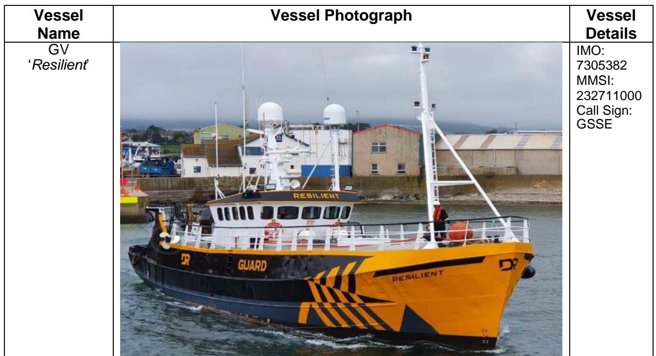
Table 2: Landfall Work vessel details

VHF CH 16 will be monitored at all times and will be used to contact the coastguard in the event of an emergency.