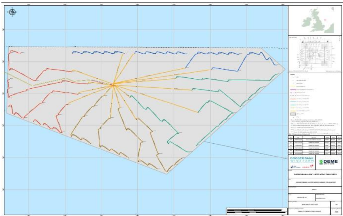
Figure 1: Fig 1 Dogger Bank A OWF IA Cable Layout