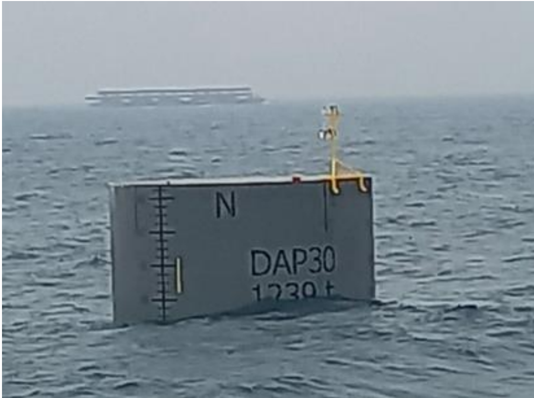
Figure 3: Photograph showing temporary Aid to Navigation Marking on installed mono-pile