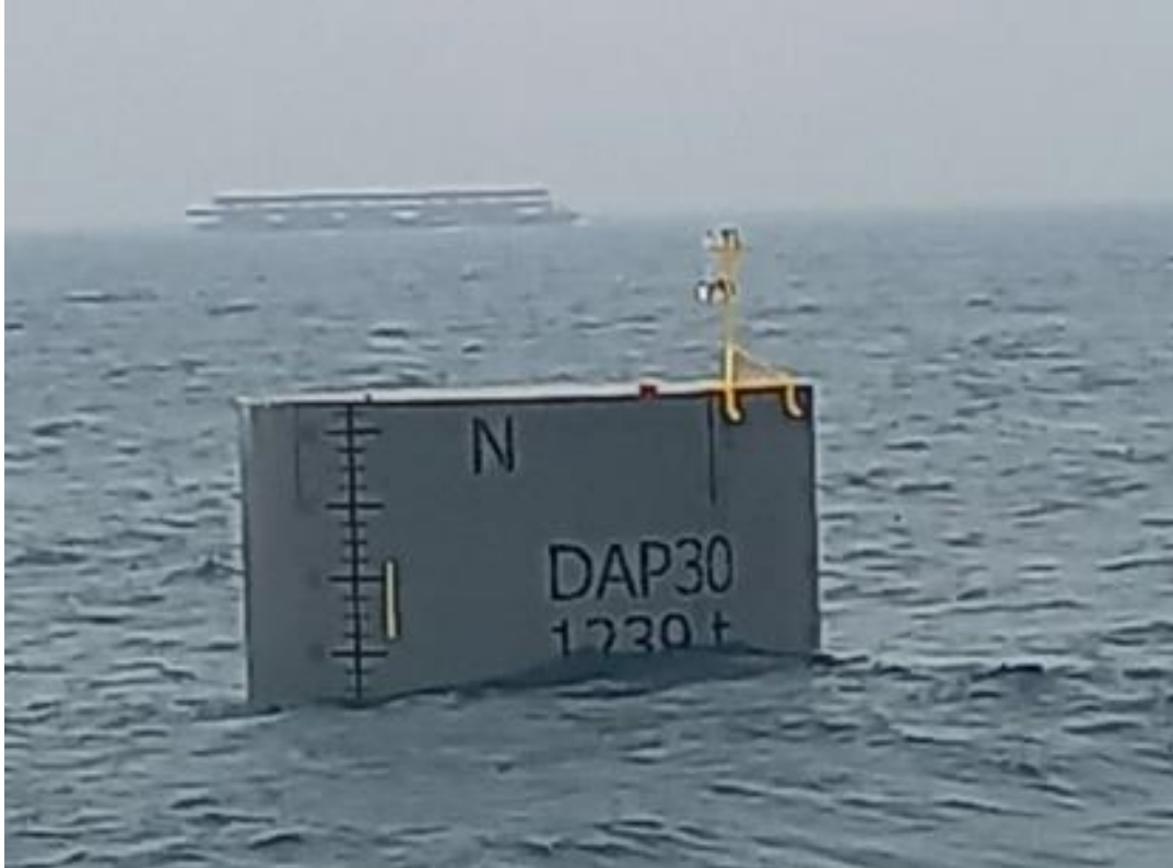
Figure 3: Photograph showing temporary Aid to Navigation Marking on installed mono-pile