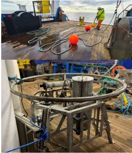
Figure. 1: Scientific monitoring seabed mooring

Scientific monitoring equipment will be moored in the vicinity of: