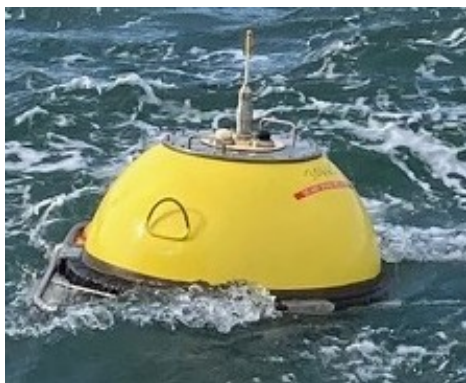
Figure 1: Waverider (approx. 1m dia.)

The Waverider Buoy is fitted with a yellow light exhibiting the sequence Fl Y (5) 20s. The LED flashlight gives 5 flashes in 10 seconds and repeats this every 20 seconds.